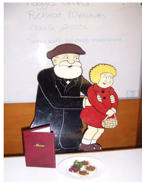
Grandpaw Broon and the Bairn can be seen admiring the Haggis Tartlets made by the students.

The S4 Hospitality class have recently been investigating Scottish cultural foods, in particular, the foods associated with celebrating the life of Robert Burns. A useful and timely resource came in the form of the "Broons' Burns Supper" book which we used to make Maw Broon's Traditional Scotch Broth. It also gave useful information on the background to the Bard's life and the verse, songs and toasts made at a traditional Burns Supper. The class were closely involved in planning their own menu and itinerary. We then developed the concept of using these traditional foods in a more modern way, making Haggis tartlets with red onion marmalade and a mousse using Scotland's other national drink (the fizzy one!) A very special visitor joined the Home Economics department for a week, courtesy of DC Thompson, to help celebrate the work of the class.