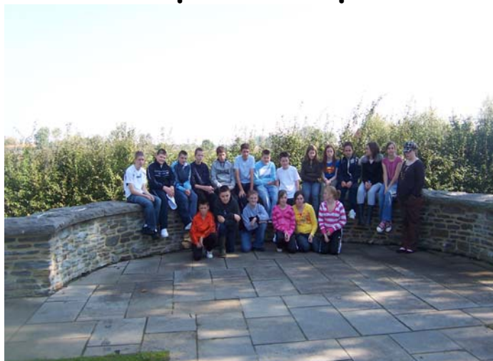
Pupils on the recent History/Modern Languages trip to the battlefields of the First World War.

A number of school trips to various parts of Europe are being planned for next session. Details of a ski trip to Italy in the February mid-term break of 2009 for around 40 to 50 pupils will be published shortly. The cost is likely to be around £645 to go for 6 nights including food, accommodation, ski passes, ski hire, evening entertainment and all transport including flights from Glasgow. We are also looking at running two separate trips to France for pupils currently in S1 and S2. One will be for boys only and will involve visiting the D-Day beaches in Normandy and Futuroscope, the European Park of the Moving Image. The other will be for girls only, with Paris the main centre. These trips would be either at Easter or June 2009. Details will be available soon.