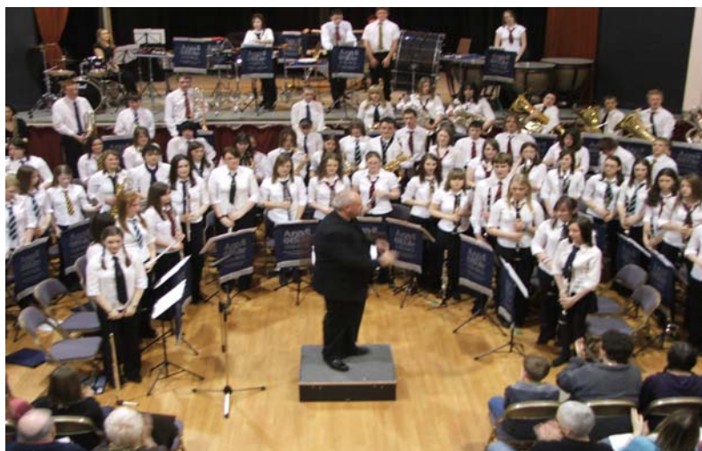
Last year's Argyll & Bute Concert Band takes a bow.

A number of our Concert Band members will be taking part in the annual Argyll and Bute Schools Concert Band course this week. The end of the course is marked by public concerts which are put on in various towns around Argyll. This year it will be Campbeltown's turn to host one of the concerts, which will take place in the Victoria Hall on Monday 18 February at 7pm. The band is drawn from the cream of Argyll & Bute's young woodwind, brass and percussion players, who will again be performing an exciting and challenging programme guaranteed to raise the roof.