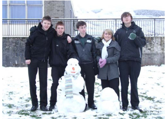
Some of the Captains and Prefects made a snowman.